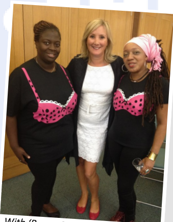
With 'BosomBuddies' in Parliament

Finally this month, Parliament was recalled to debate the use of air strikes in Iraq. Involvement in any form of military action is not something I support lightly. I went to Parliament still undecided about how I would vote and looking for reassurances that involvement would not entail British combat troops on the ground and a commitment to a vote in Parliament if any further action is needed. The PM stressed that the Iraqi Government has directly asked us for help; that 60 other countries including 10 Arab nations are also involved and the growing threat to British people at home if ISIS are not tackled. It is for that reason that I supported the motion.