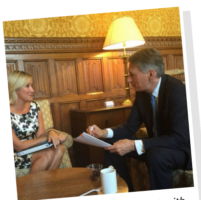
Making the case for Gosport with the Chancellor

I was treated to a preview of an exhibition at the Gosport Gallery which explored the way that our public transport has changed over the years. The exhibition used archive material held by Hampshire County Council and The Provincial Society, and presented a vivid picture of the way our parents and grandparents used to get about. It's been a while since horse-drawn trams have been spotted on the Gosport High Street!