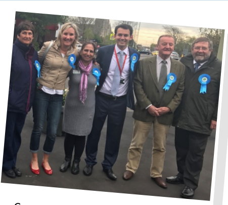
Campaigning across the constituency

The past month has absolutely flown by - it's hard to believe that the general election is now just eight days away! Parliament dissolved on the 2<sup>nd</sup> of May and since then I have been pounding the streets of Gosport, Lee-on-the-Solent Stubbington and Hill Head, meeting lots of local people, as I have over the last 7 years, to discuss the issues that matter to them.