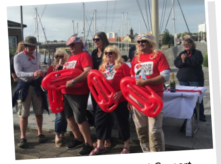
The 'Baywatch' crew at Gosport Marine Scene charity yacht race

The Queen's Speech then laid out the Government's legislative programme, signal-ling the beginning of the new Parliament – which promises to be rather busy! I am looking forward to the next five years, and will continue working hard to represent the best interests of Gosport, Stubbington, Lee-on-the-Solent and Hill Head.