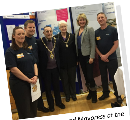
With the Mayor and Mayoress at the Gosport Business & Employment Fair

Happy New Year to you! After a great Christmas and New Year with my family at home in Gosport, we ushered in 2016 by joining the crowds at Stokes Bay for the traditional GAFIRS New Year's Day charity swim. We were watching not swimming, of course, ... maybe next year!