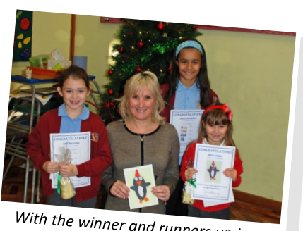
With the winner and runners up in my Christmas Card competition

December marked the start of a very busy festive season; there were lots of events across the constituency to get us in the Christmas spirit! Christmas lights were formally 'switched on' in Gosport town centre, Lee on the Solent & Stubbington Village - usually involving some very jolly carol singing and something yummy to eat/drink. The Alverstoke Christmas Tree Festival is always a favourite with my own children.