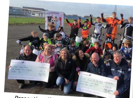
Presenting 4k to local charities with the daring Tigers Motorcycle Display team.

I joined the children of the Tigers Motorcycle Display Team who have raised over £4K for local charities. I was not only impressed by their fundraising skills, but also their talent as they took turns to jump over me on their motorbikes.