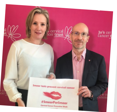
Supporting the #SmearForSmear Cervical Cancer Campaign.